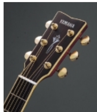
Headstock The DW/DWX series guitars feature beautiful mother of pearl inlays on their headstocks.