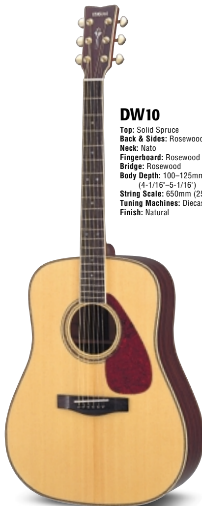
DW10 Top: Solid Spruce Back & Sides: Rosewood Neck: Nato Fingerboard: Rosewood Bridge: Rosewood Body Depth: 100–125mm (4-1/16"–5-1/16") String Scale: 650mm (25-9/16") Tuning Machines: Diecast Gold Finish: Natural