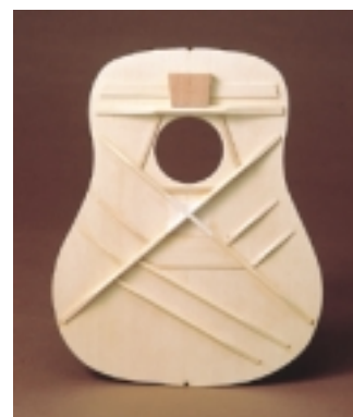
Bracing The bracing configuration found on the DW series is specially adapted for use on dreadnoughts from a design used on our LA series guitars. Along with excellent sound quality these instruments offer a powerful sound.